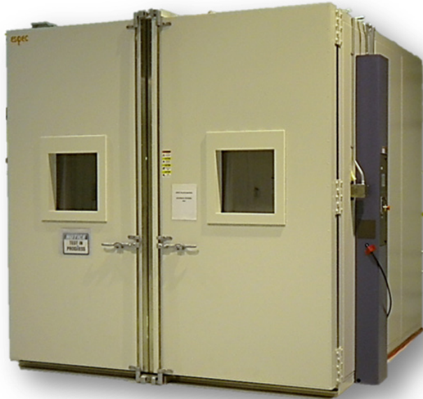
AREVA's large chamber can accommodate most components without disassembly, allowing for operational tests.