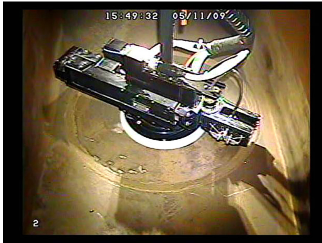
Access hole cover inspection tool