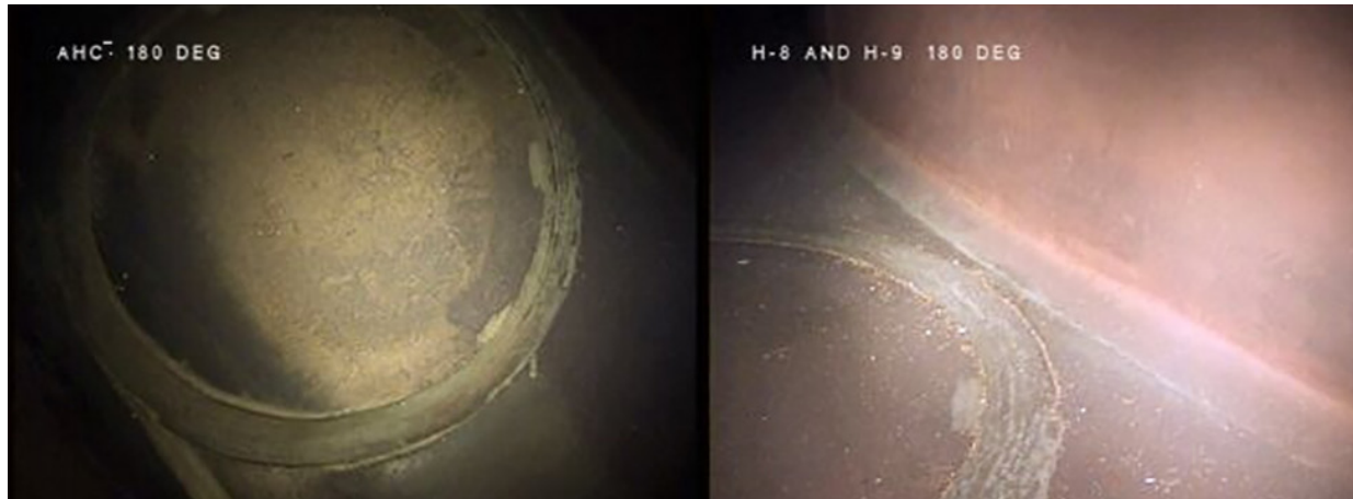
In-service access hole cover

Response to Industry Issue with Technical Innovation