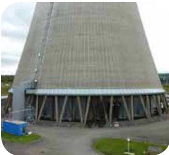
Cooling tower after realization of optimization works