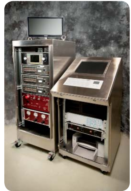
ECHO-330 Control Consoles

AREVA Inc. Corporate Headquarters 7207 IBM Drive Charlotte, NC 28262